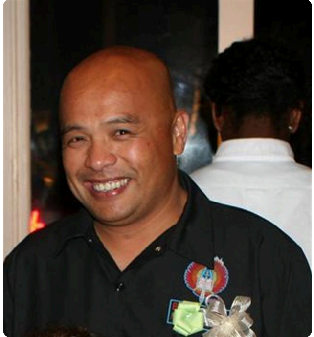
Again that smile!