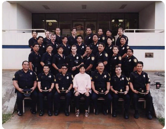
One of Hawaii's Finest!