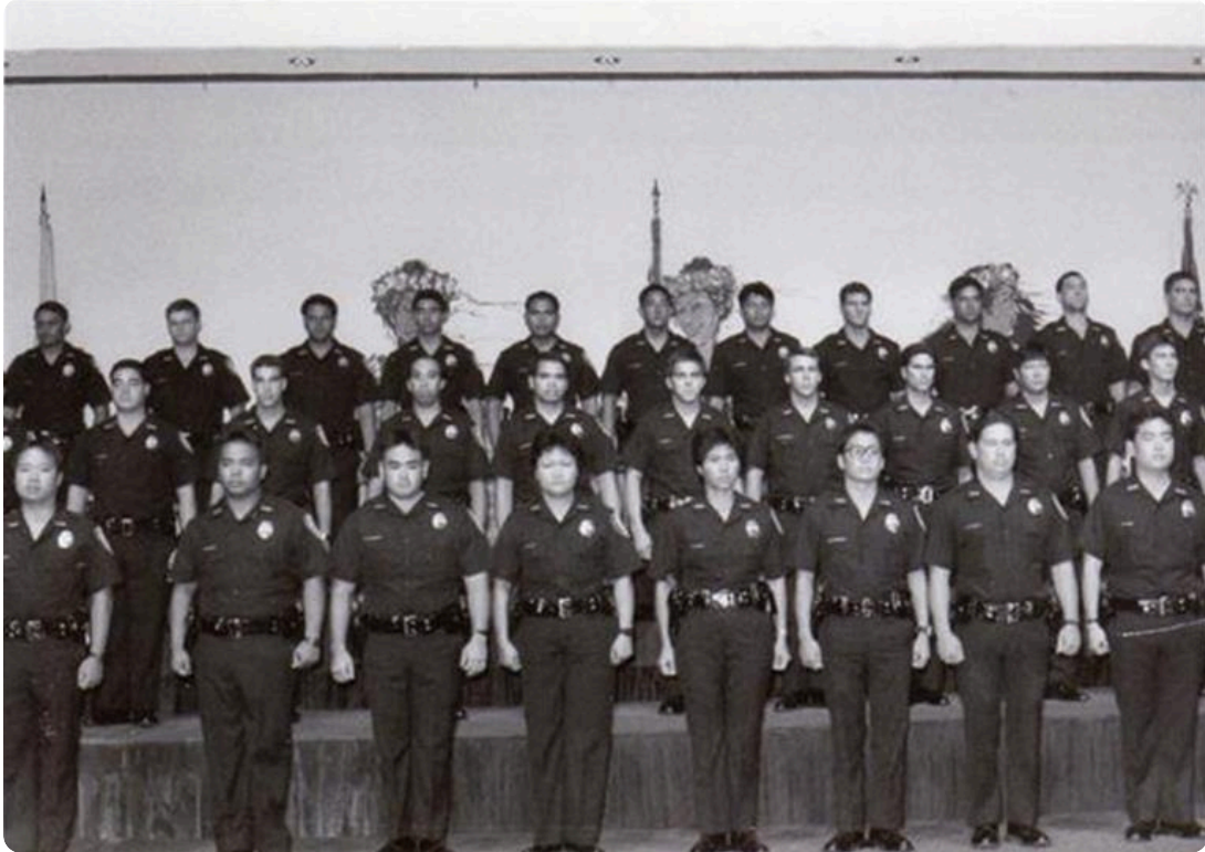
86th HPD Recruit Class