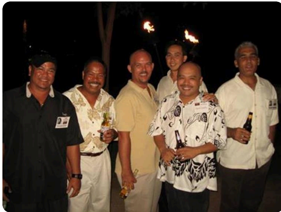
A friend to all who knew him!